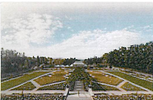
Gardens & Grounds