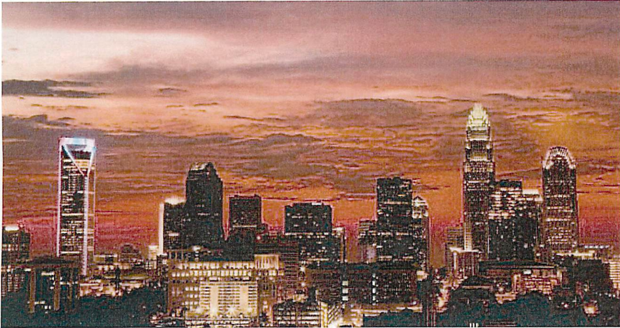
Sunset behind the Charlotte skyline.

Get the basics about Charlotte, then start exploring!